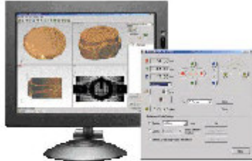
MODELA Player4 & on-screen, operation panel