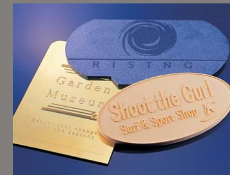
Software : Dr.Engrave