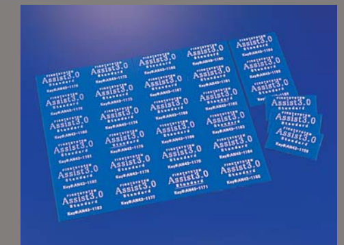
Software : Dr.Engrave