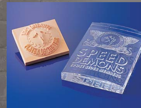
Software : 3D Engrave