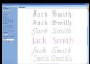
Engrave text with a variety of fonts including TrueType or Single Line.

Roland EngraveStudio offers a variety of engraving depths that together produce a truly hand-carved look. Preview your designs on screen through the engraving simulation function that presents both the tool path and anticipated results prior to engraving. Import designs from Adobe Illustrator*2 (ai and eps) and CorelDraw (eps)*3 for precision text and graphics. Roland EngraveStudio is compatible with Windows® 2000/XP and Windows Vista™.