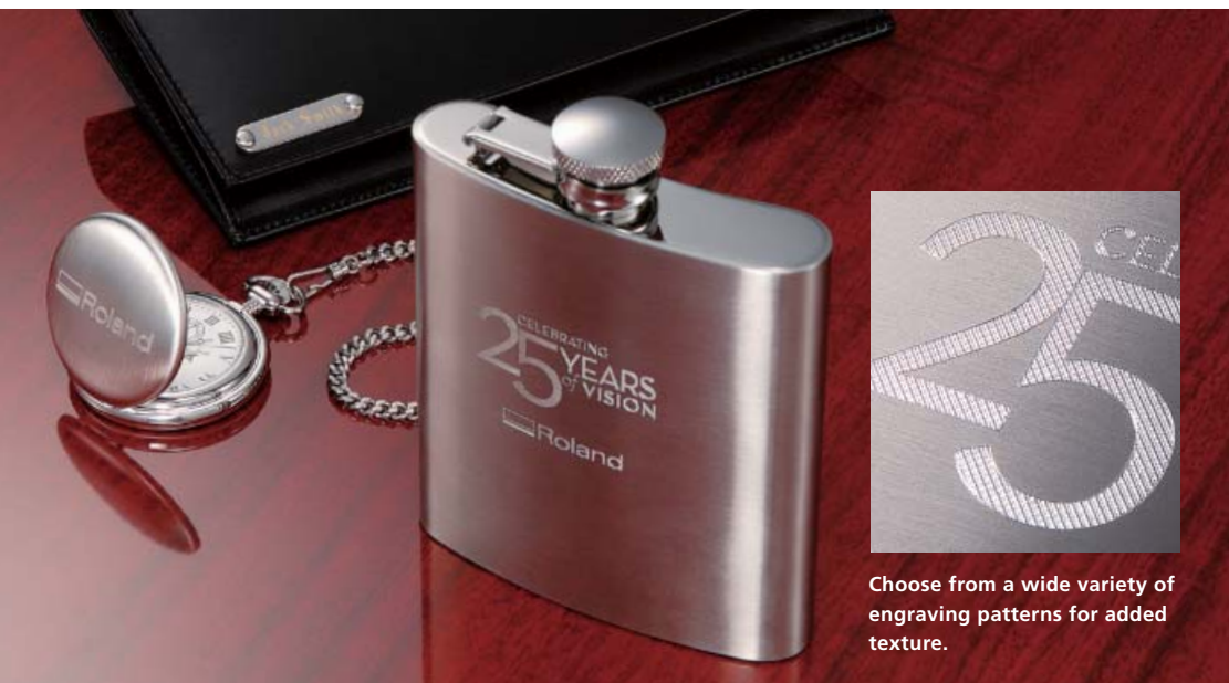
Choose from a wide variety of engraving patterns for added texture.