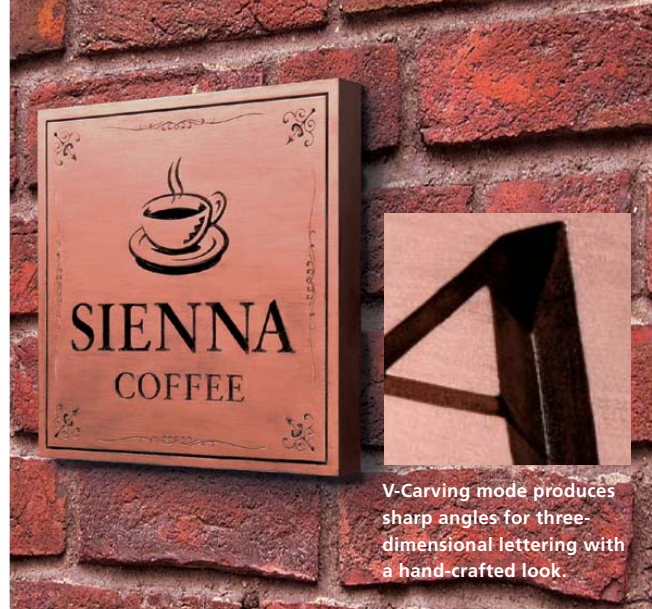
V-Carving mode produces sharp angles for three-dimensional lettering with a hand-crafted look.