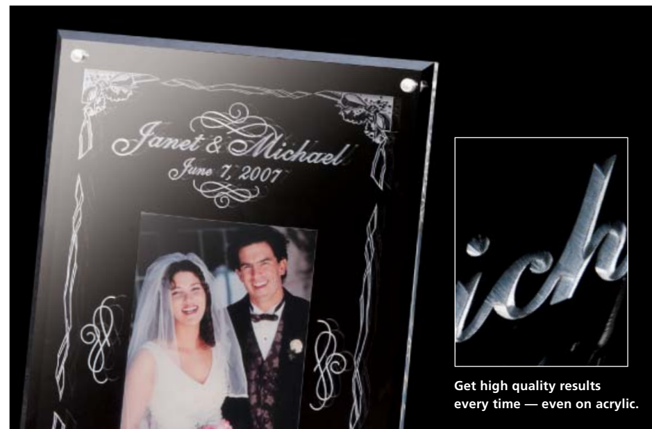
Get high quality results every time — even on acrylic.