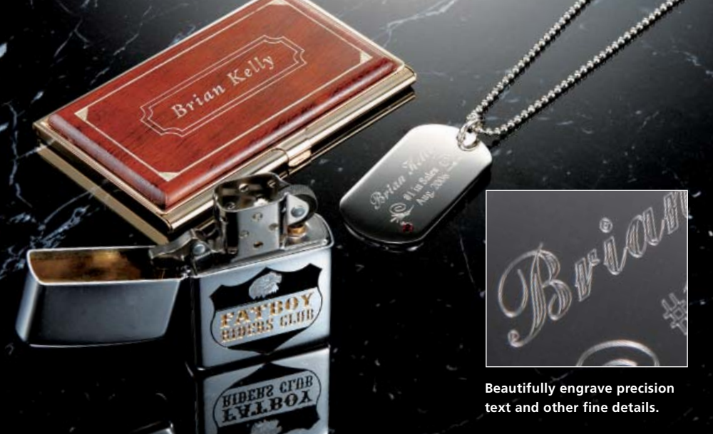
Beautifully engrave precision text and other fine details.