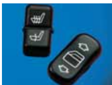
Version Vario RD with options